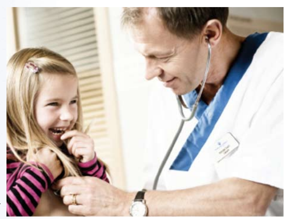
The author (right) in practice

I feel that we are not even at the beginning of the end in human genetics, but rather at the end of the beginning.